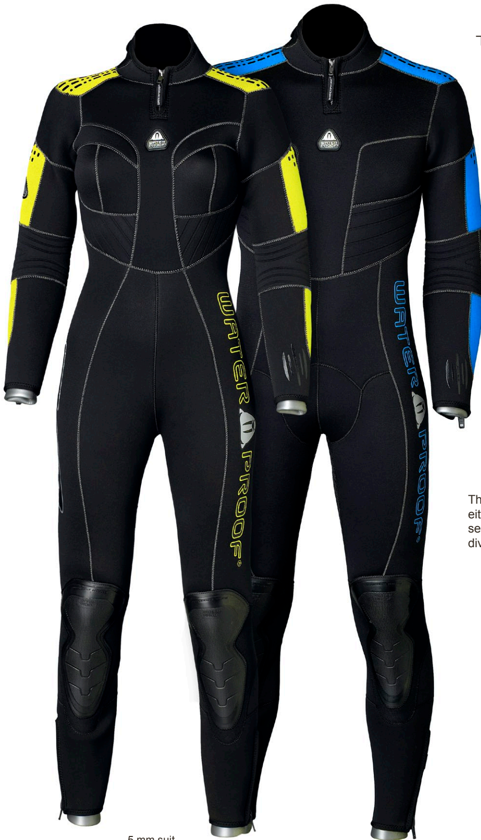
5 mm suit

W2, where all pieces conjuncts into perfection.